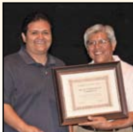
Employer of the Year: Specialty Merchandise Corporation

At the celebration, Fiscal Ambassadors and their guests were joined by Fiscal staff and officials. The award ceremony, which was preceded by a celebratory lunch, concluded with the formal presentation of achievement awards to recognize Ambassadors for their special contributions to the Credit Union. Following the ceremony, attendees spent the rest of the afternoon enjoying everything the California Adventure Park had to offer.